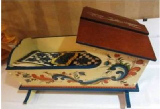
Crib for auction at St. Cloud