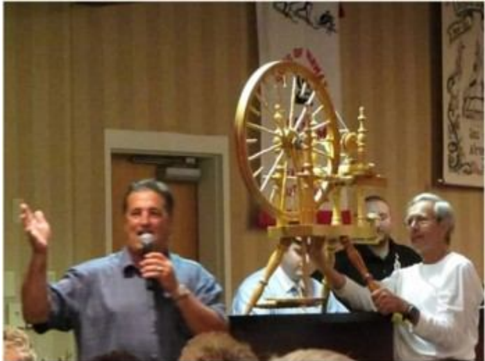
Auction of Spinning Wheel at St. Cloud