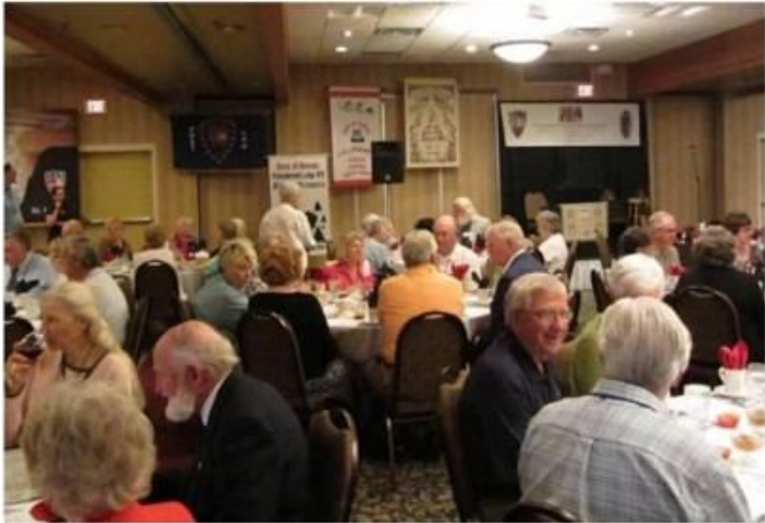
Banquet at the St. Cloud Convention