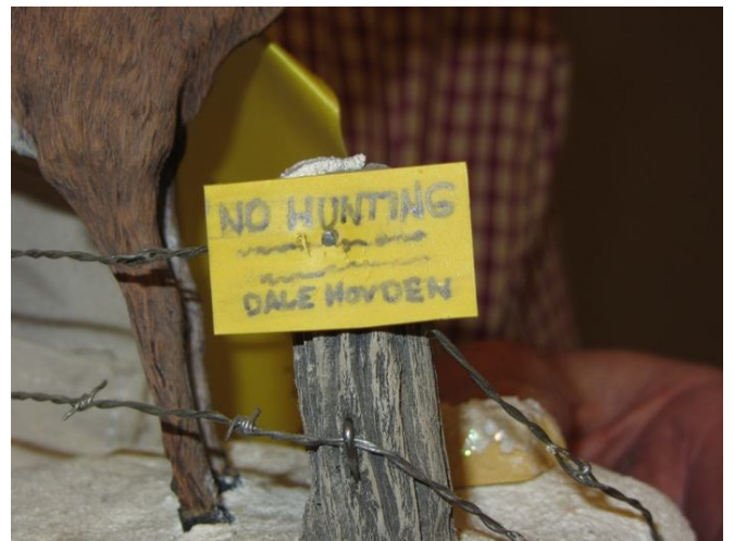
Now you can see where the deer is-of course, in a No Hunting zone!