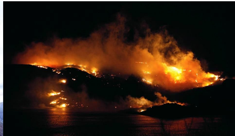
Raging Fire at Flatanger