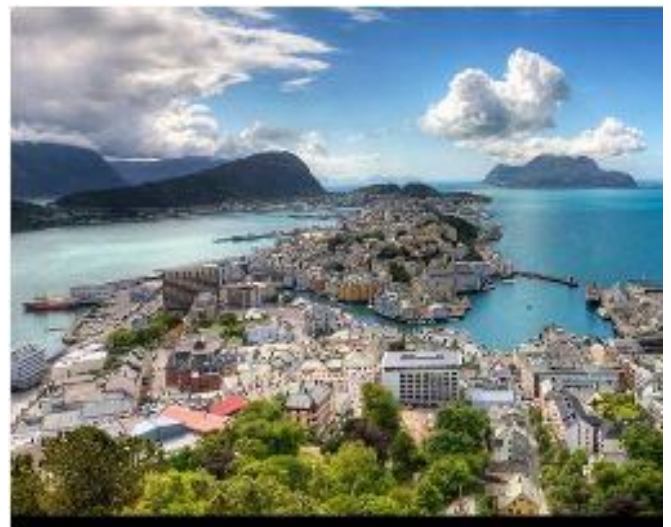
Alesund in More og Romsdal