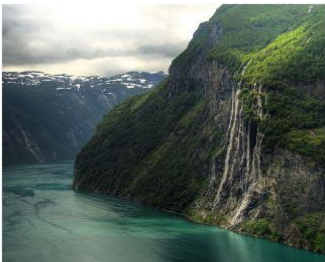
7 Sisters Falls in More og Romsdal