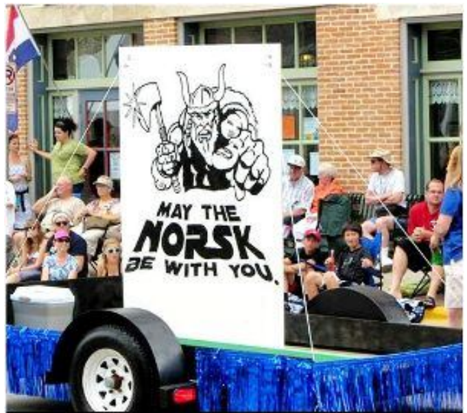
Float in the 2014 Decorah Syttende Mai parade