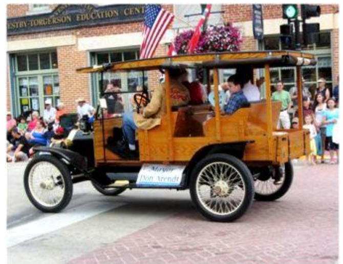
Old car in the 2014 Decorah Syttende Mai parade