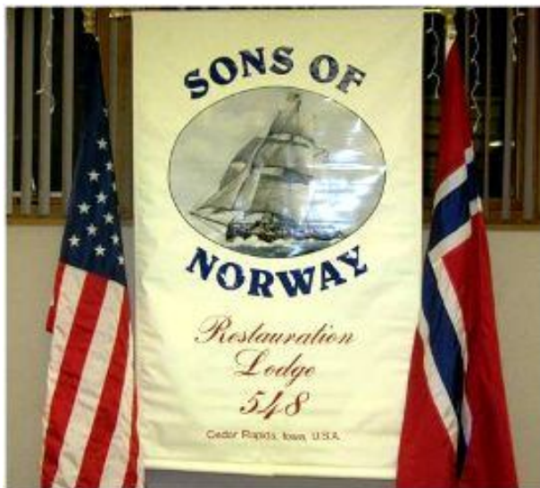
Our excellent banner for Restauration 1-548 Lodge and flags.