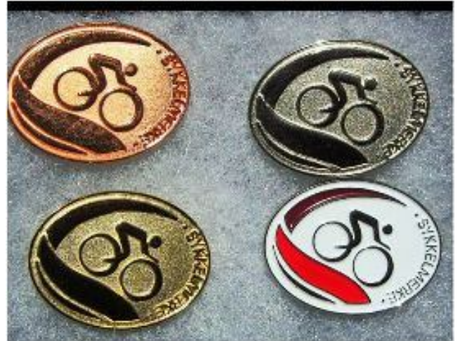
Biking medals won by Alan Erickson recently for biking a total of 950 miles.