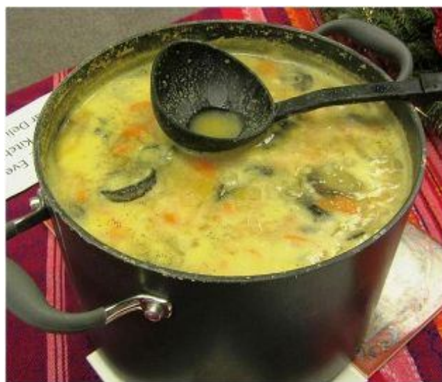
One of Cindy's soup pots-Yum!