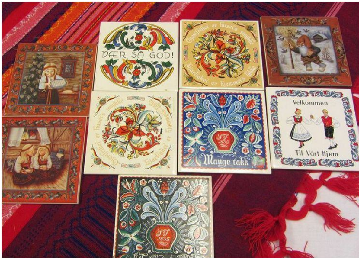
Cindy's fancy tiles used for trivets at the food table in December