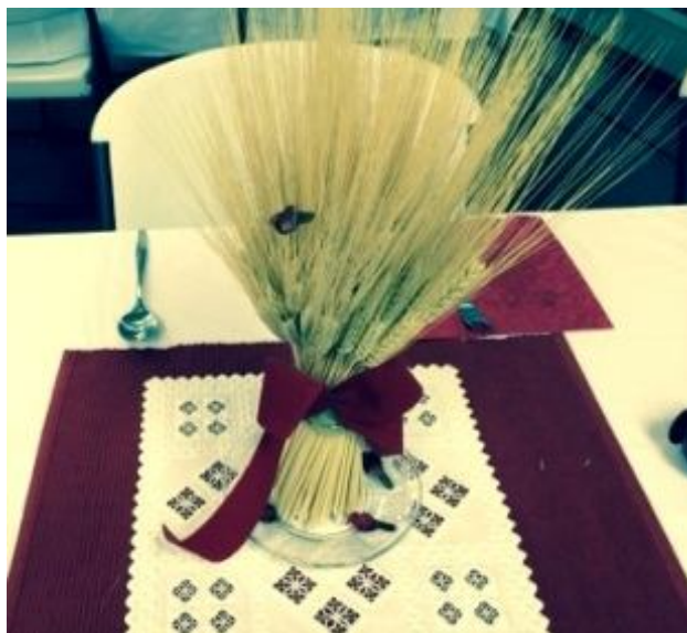
One of Bev Robeck's neat wheat table centerpieces