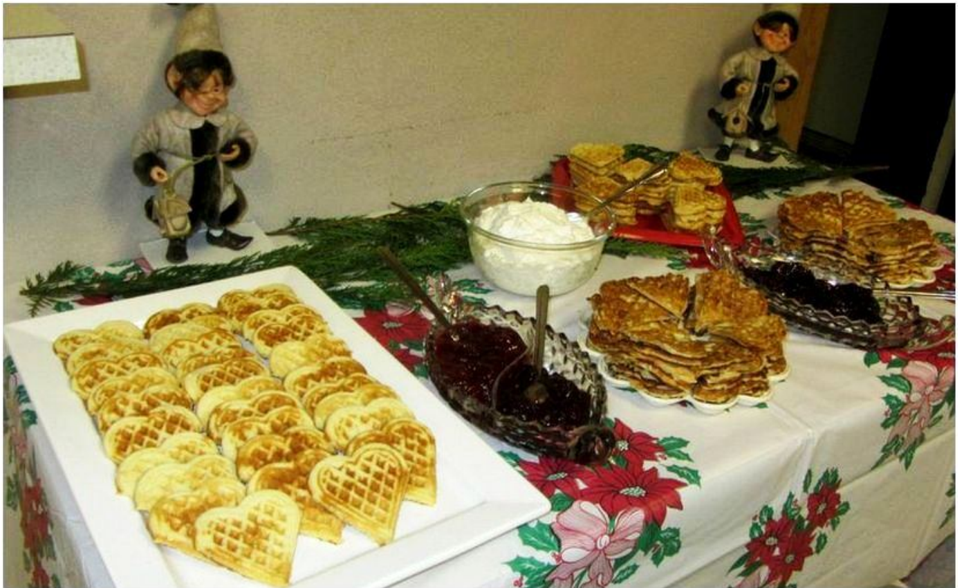
Dessert table at the December meeting guarded by several trolls