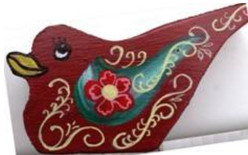
Closeup of a typical Bird -several hundred more to do-Help!!