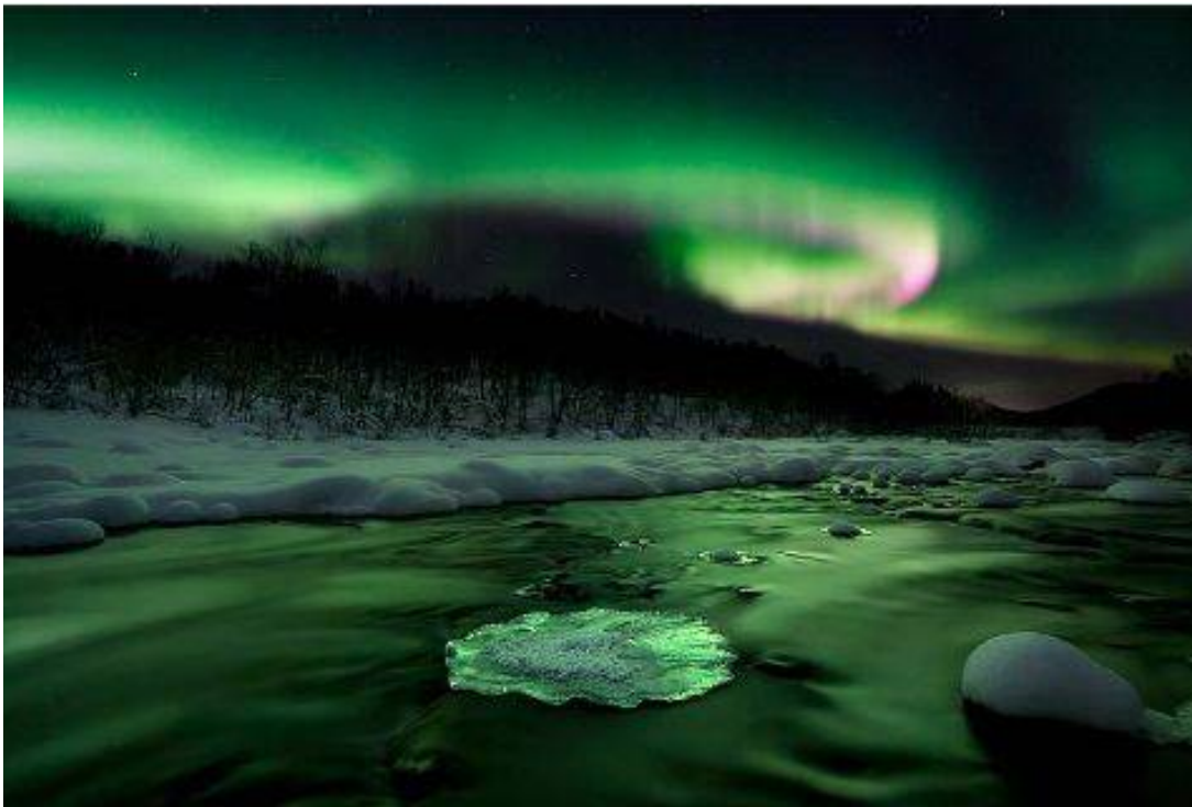
Green blanket over the mountains in Norway