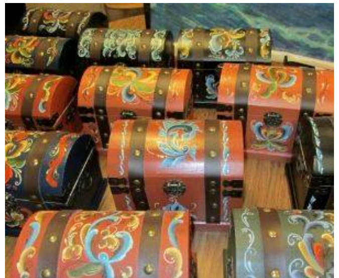
Mini-Trunks by Marvin Robeck for sale at the Convention