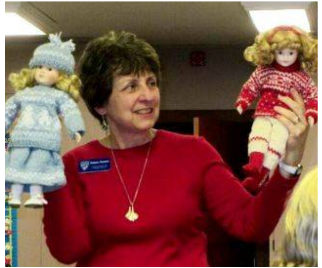
Member-created dolls for sale at the Convention