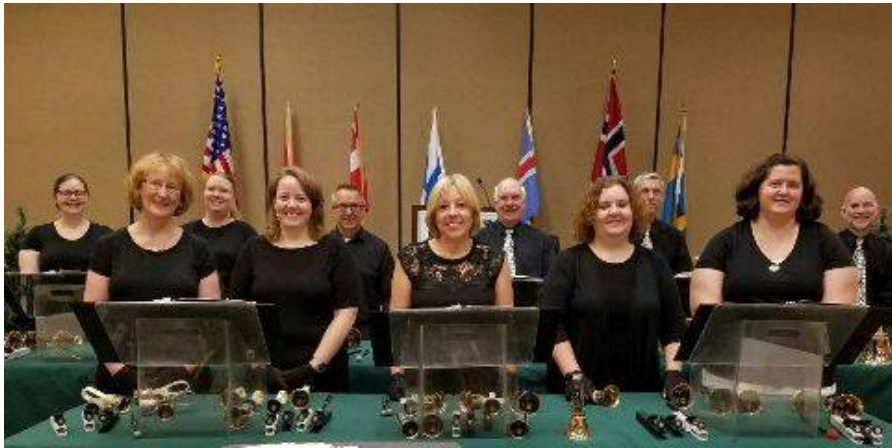
Bell ringers from area churches performing at the convention