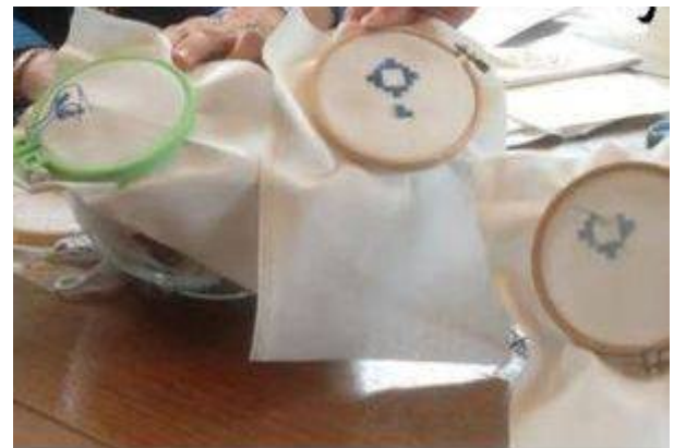
Hardanger class at the Convention