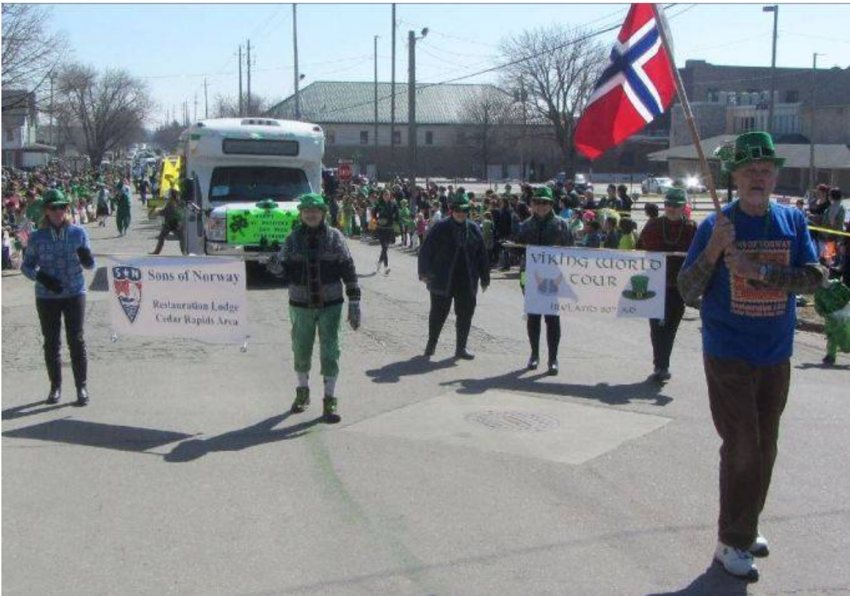
The SON crew marching down the street in the SaPaDaPaSo St. Patrick's Day Parade Good publicity for the Norwegians and our SON lodge as the Vikings mingled with the Irish so long ago.