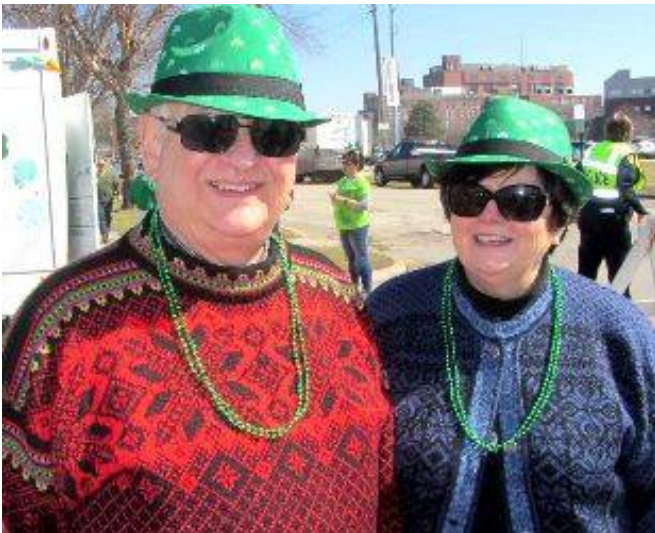
Robecks and their marching outfits"