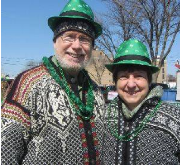
Ericksons and their marching outfits