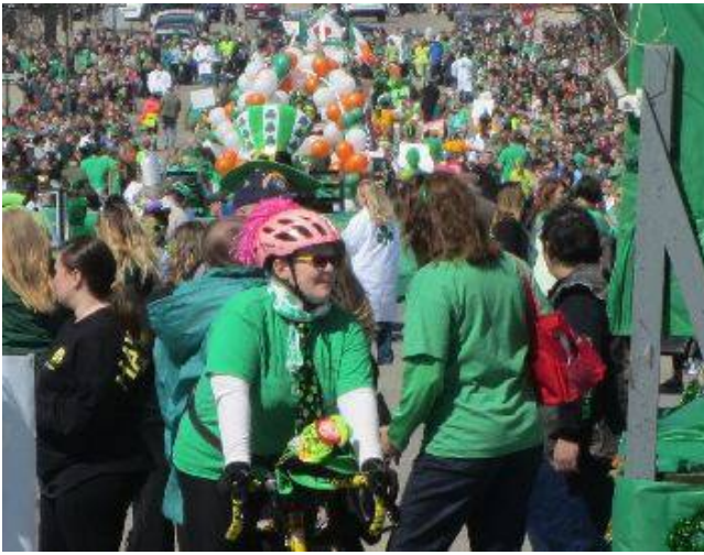
Queuing up for the parade