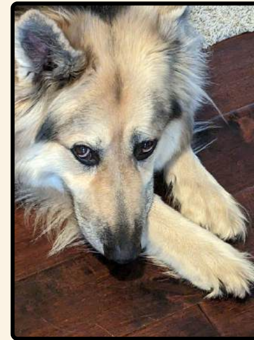
Zeus, our book club mascot.